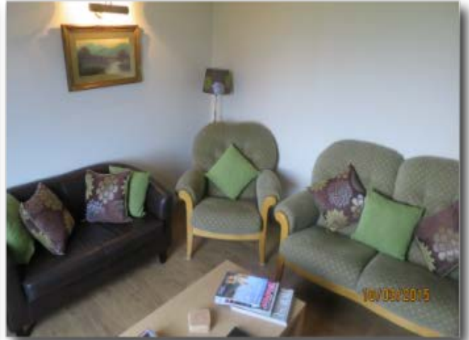
Forge lounge area